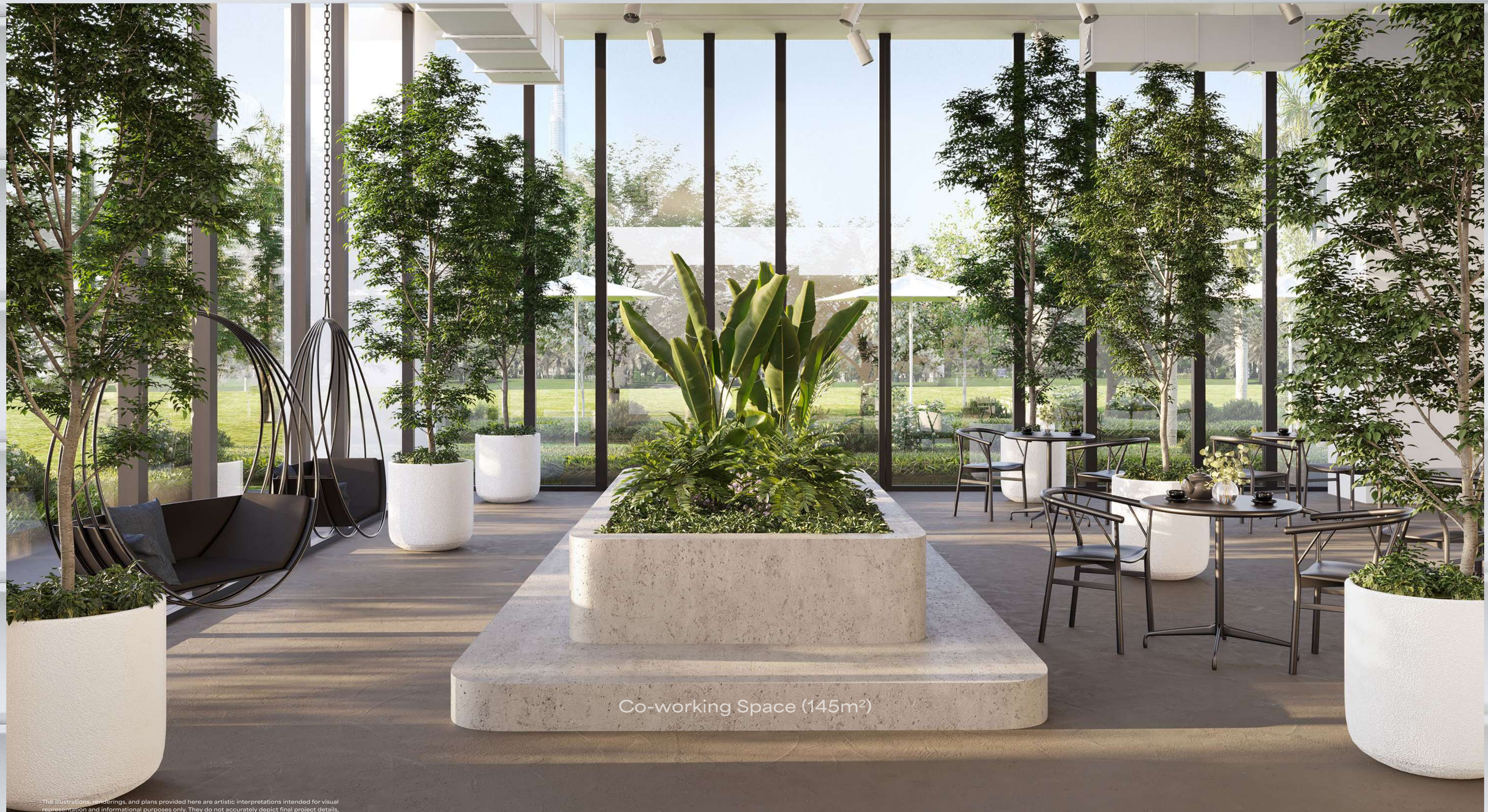
Co-working Space (145m 2 )