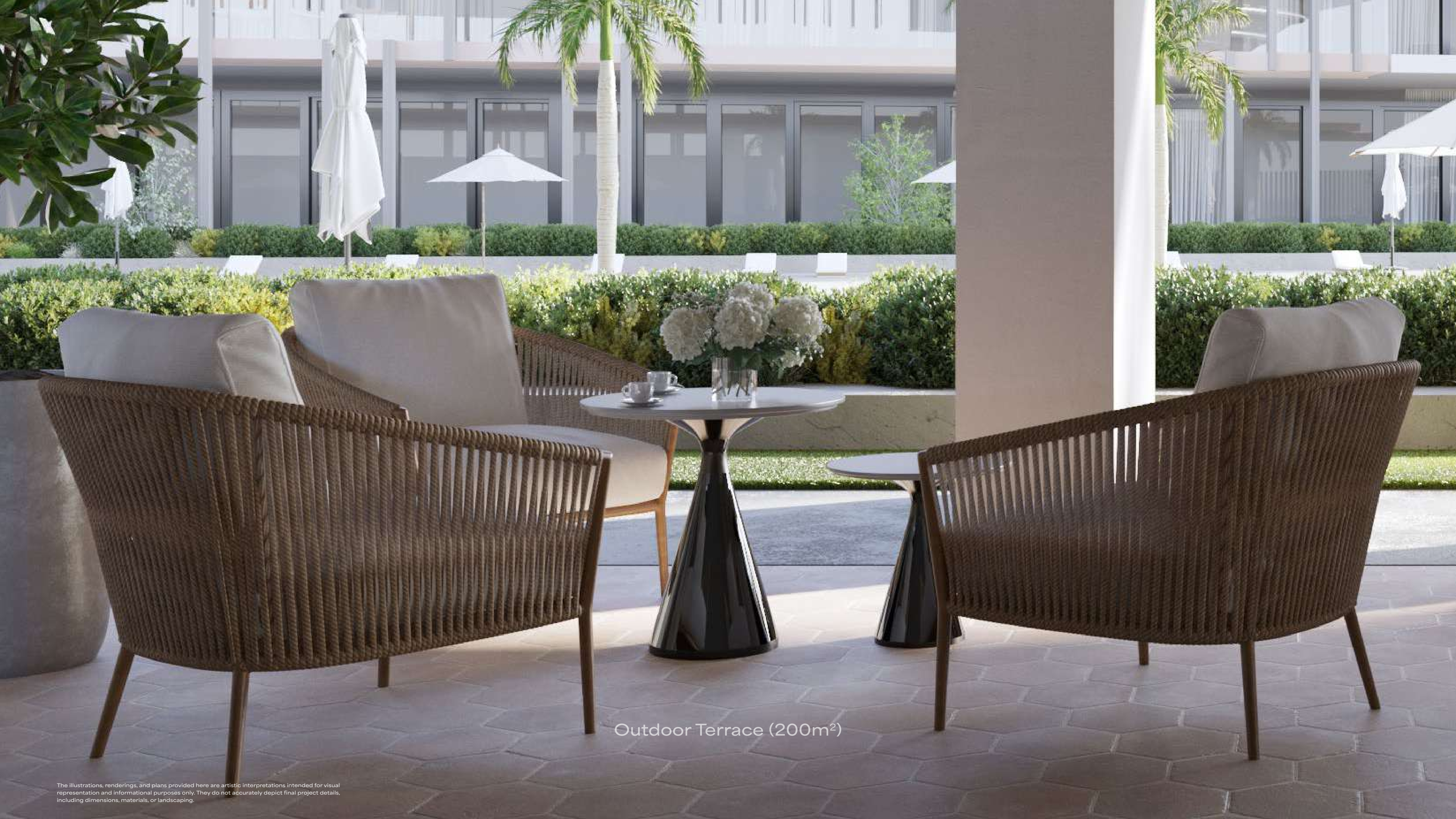
Outdoor Terrace (200m 2 )