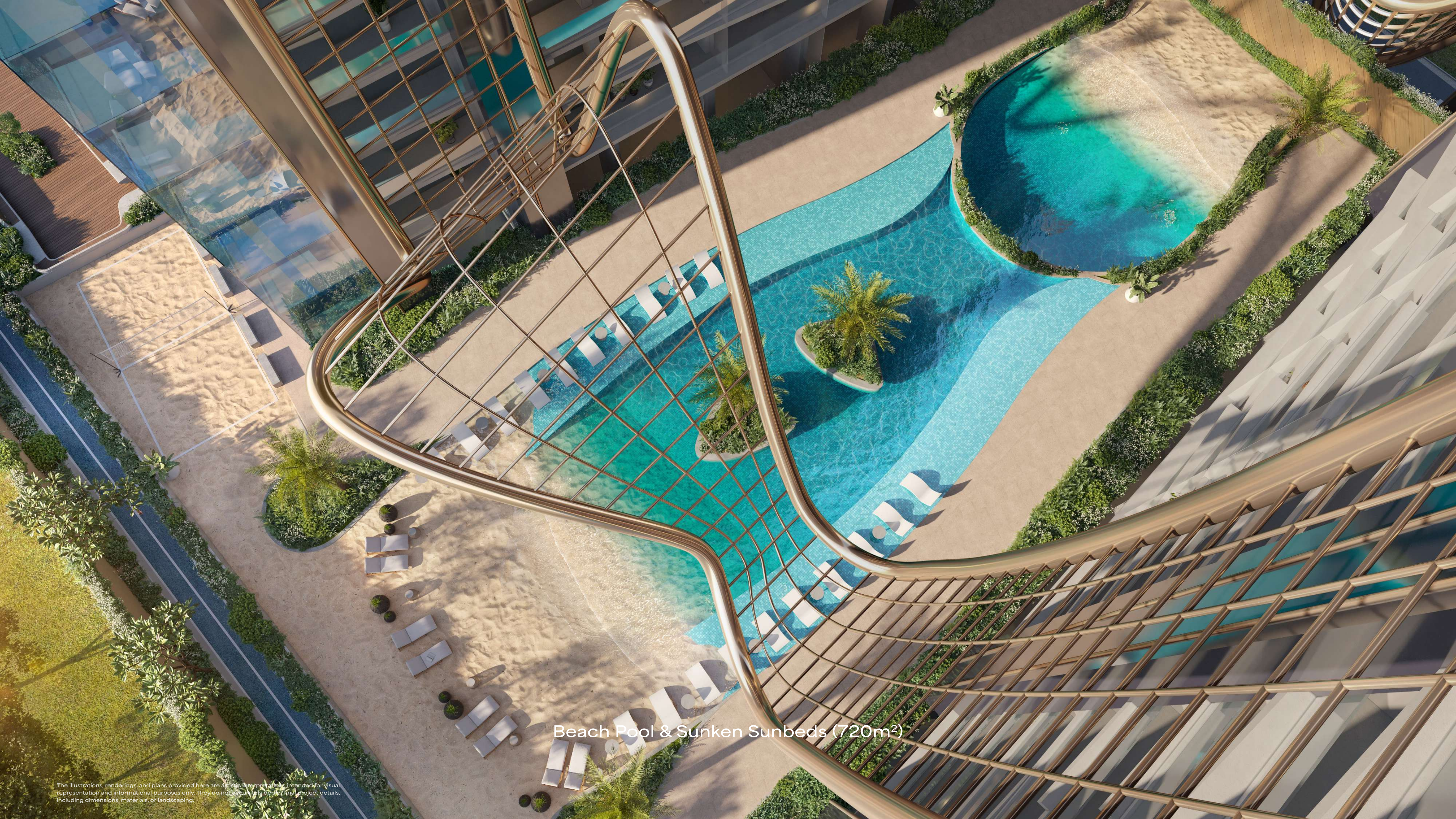
Beach Pool & Sunken Sunbeds (720m 2 )