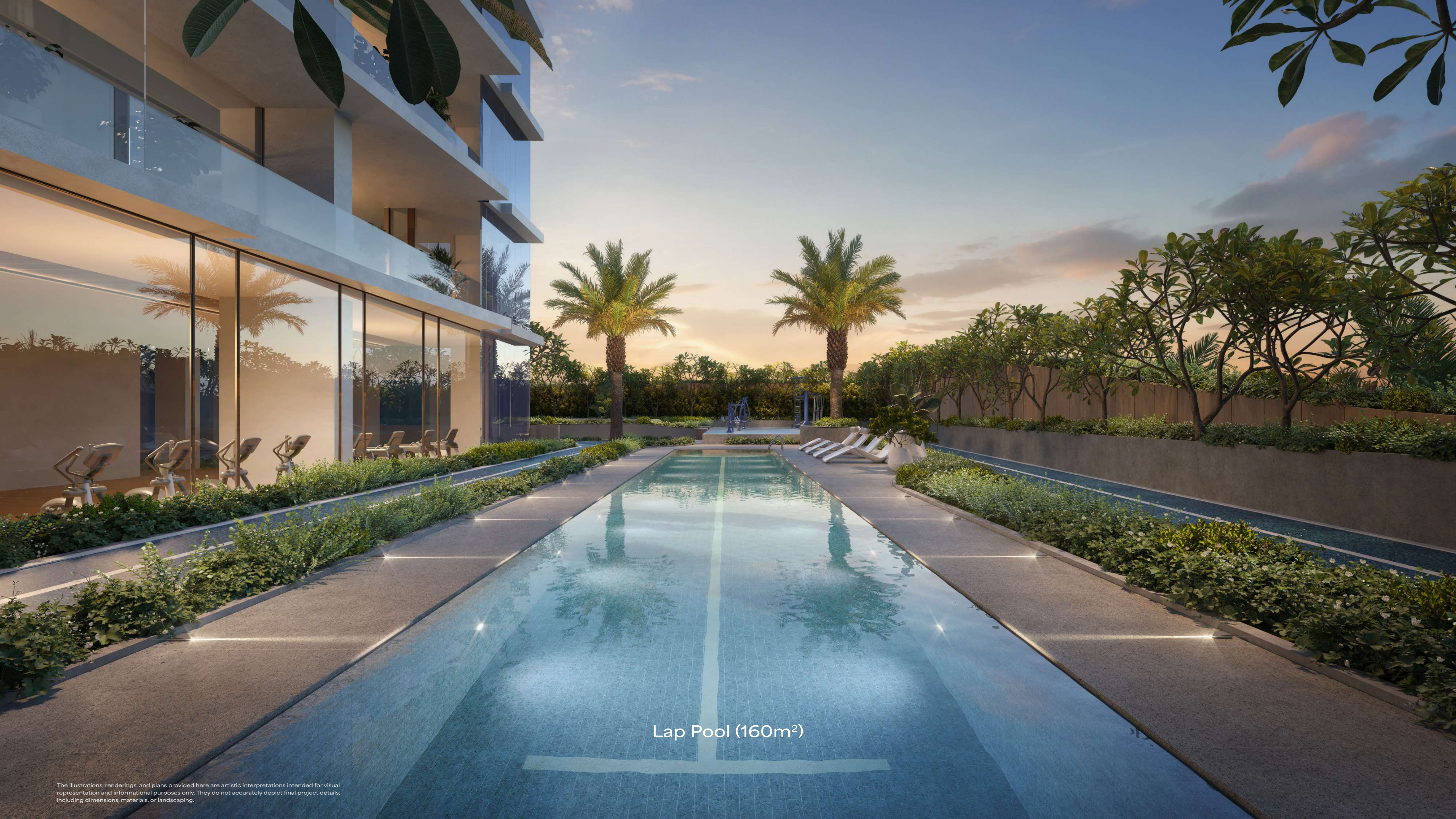
Lap Pool (160m 2 )