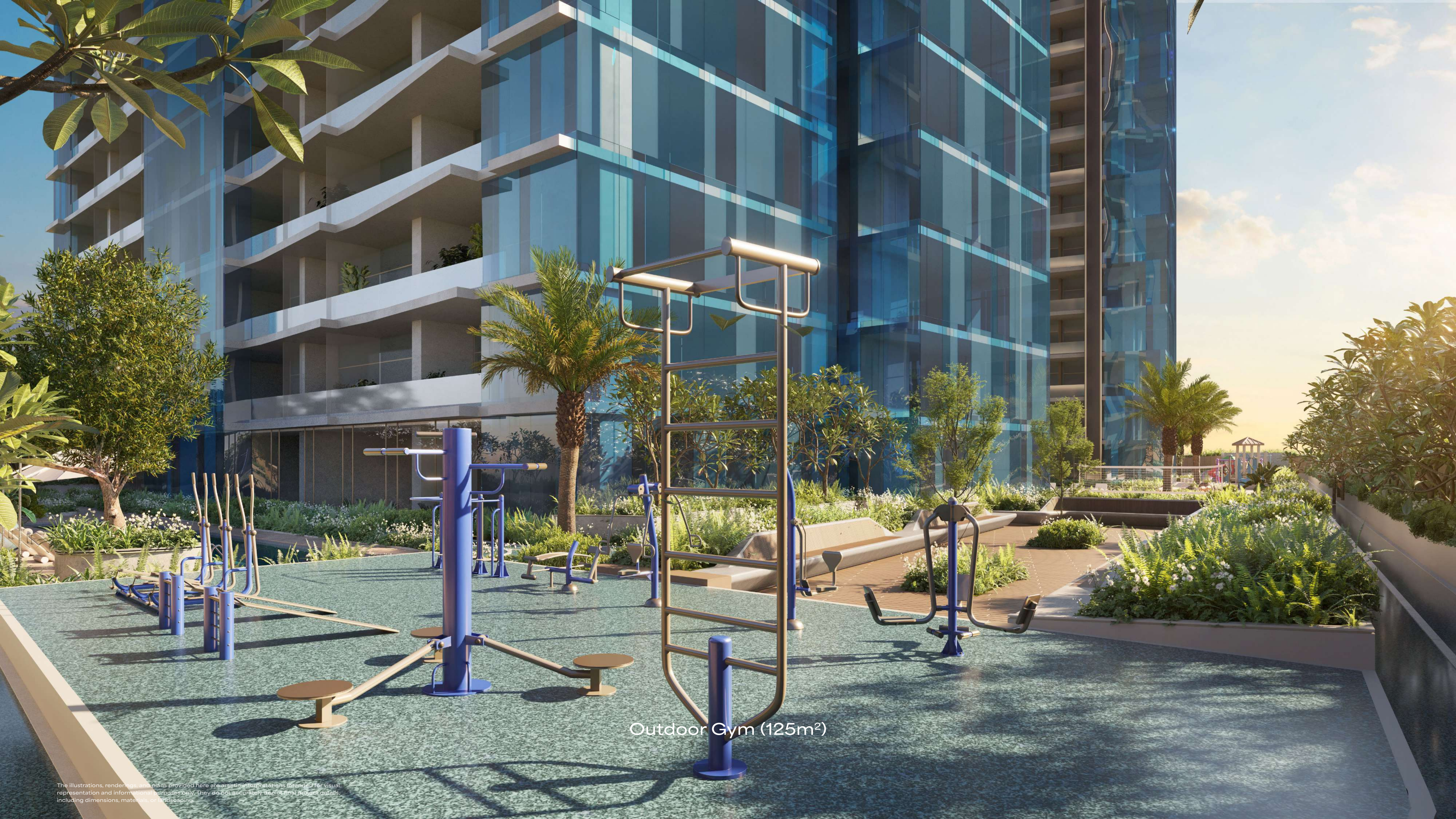
Outdoor Gym (125m 2 )