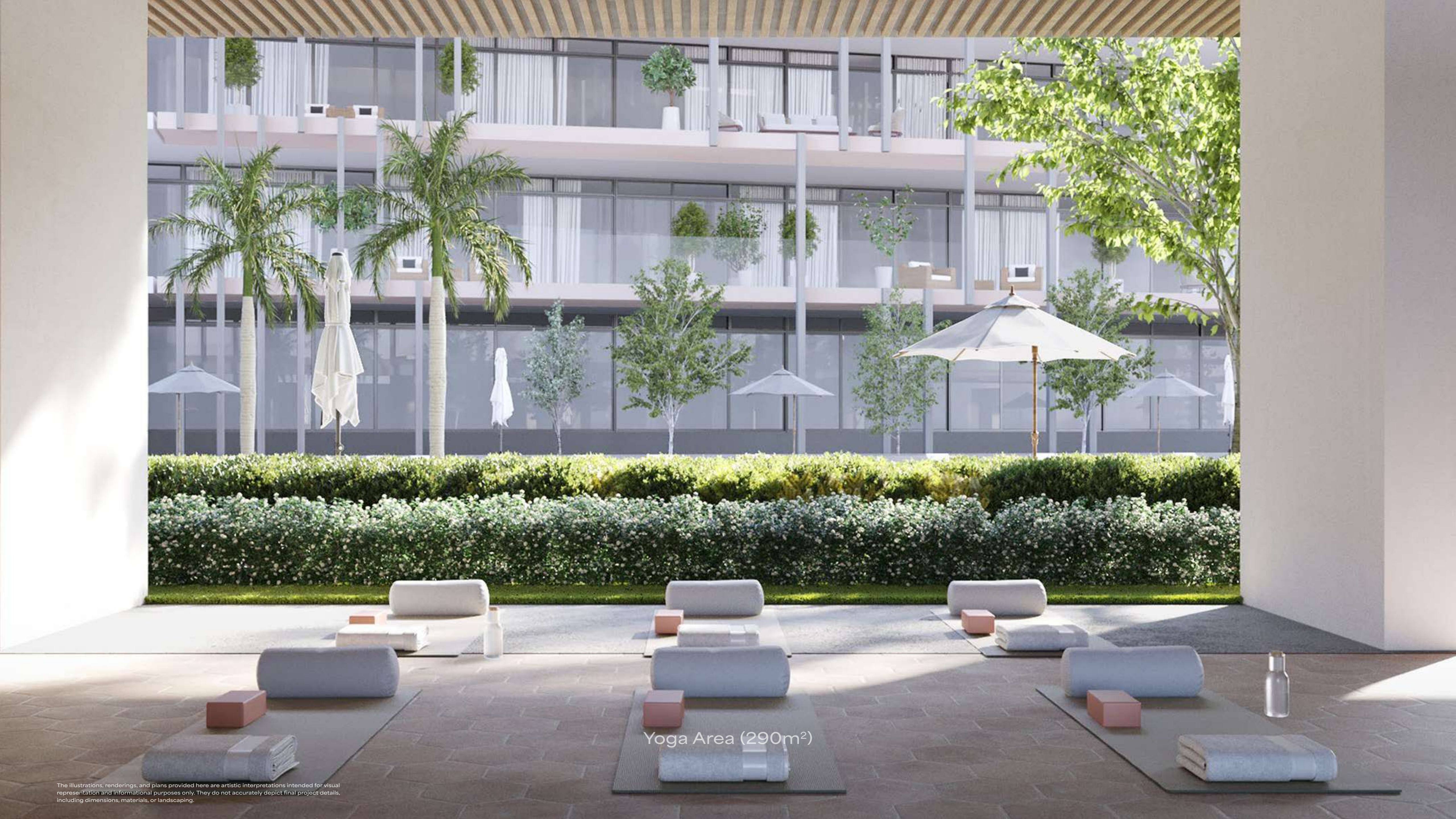
Yoga Area (290m 2 )