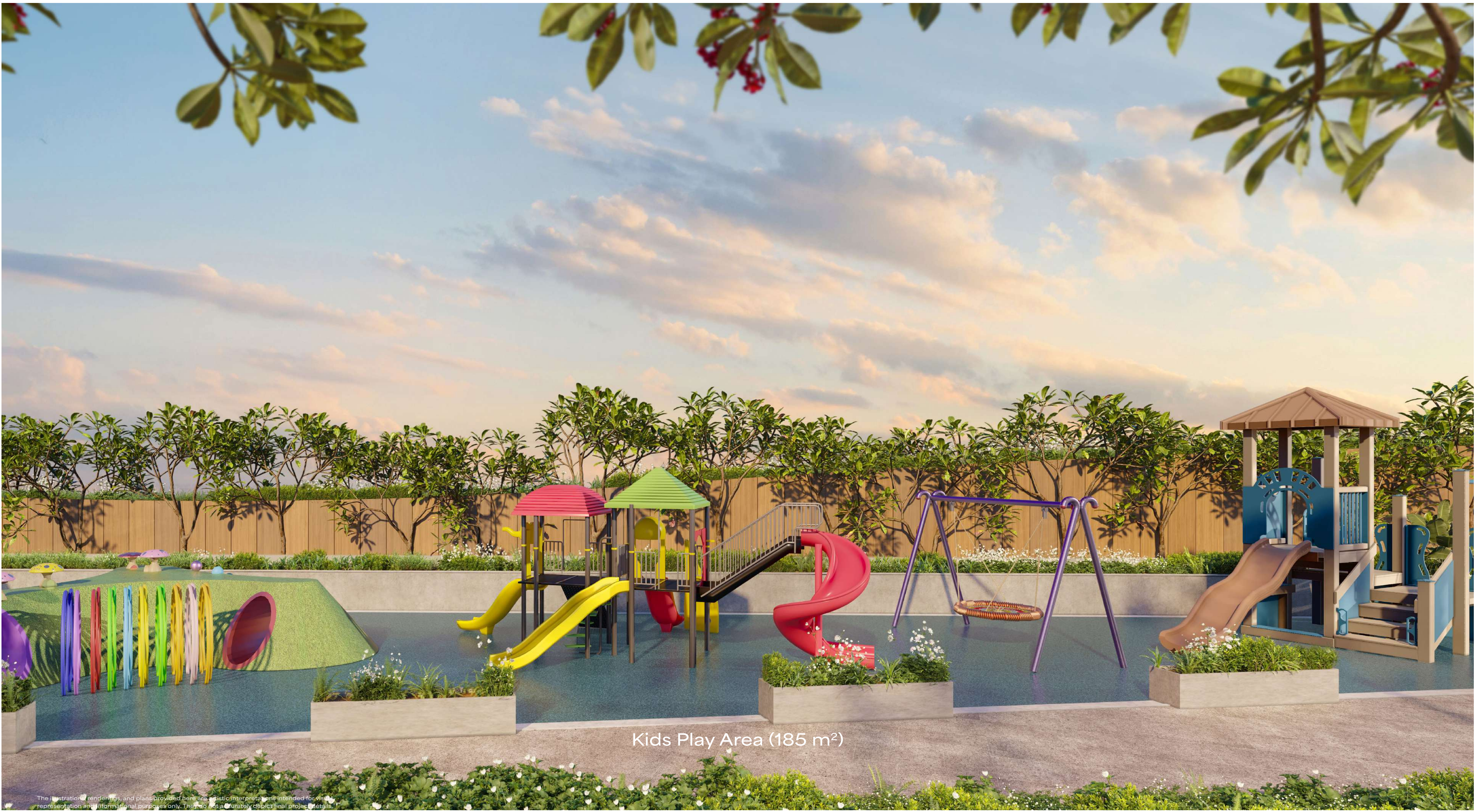
Kids Play Area (185 m 2 )