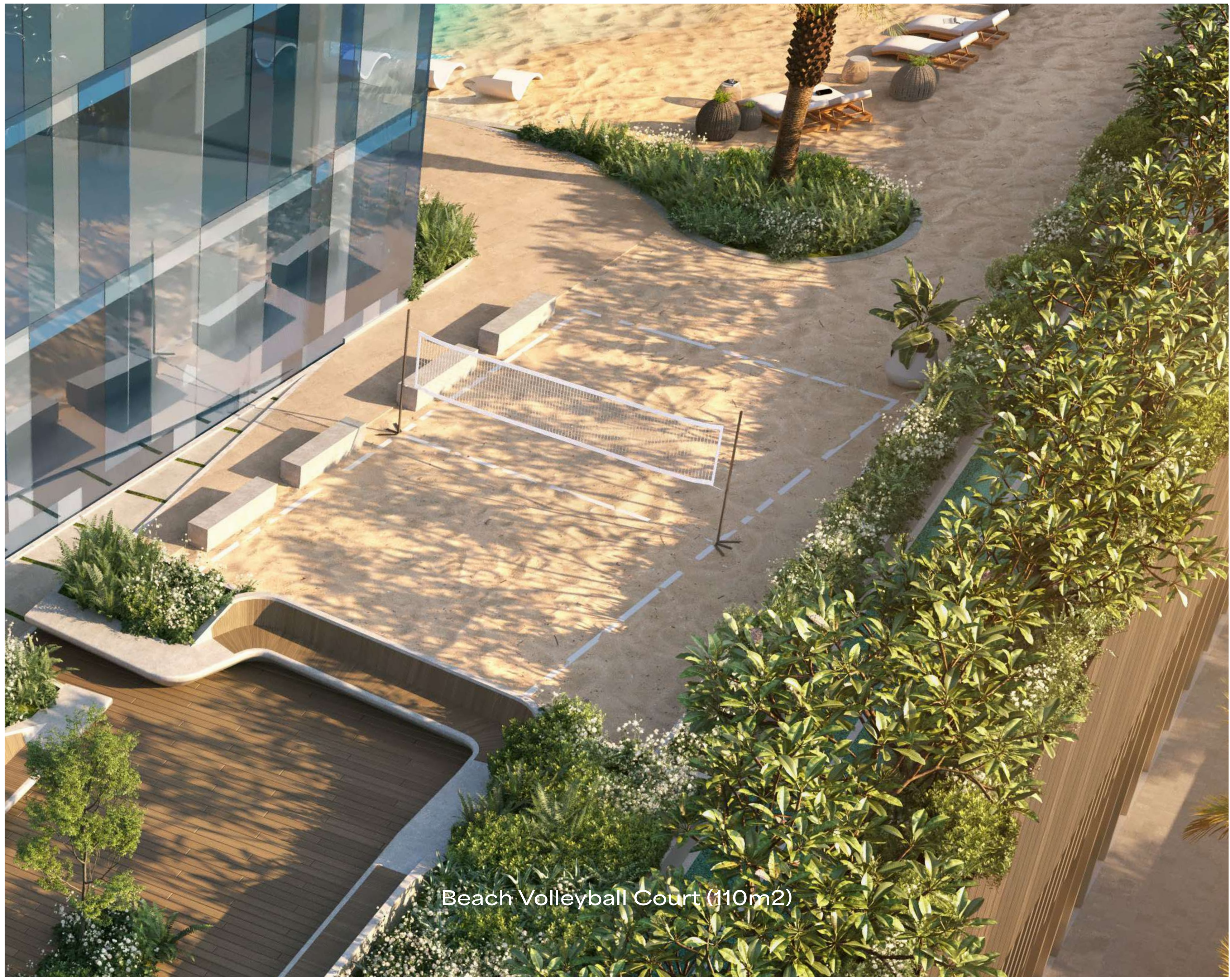
Beach Volleyball Court (110m 2 )