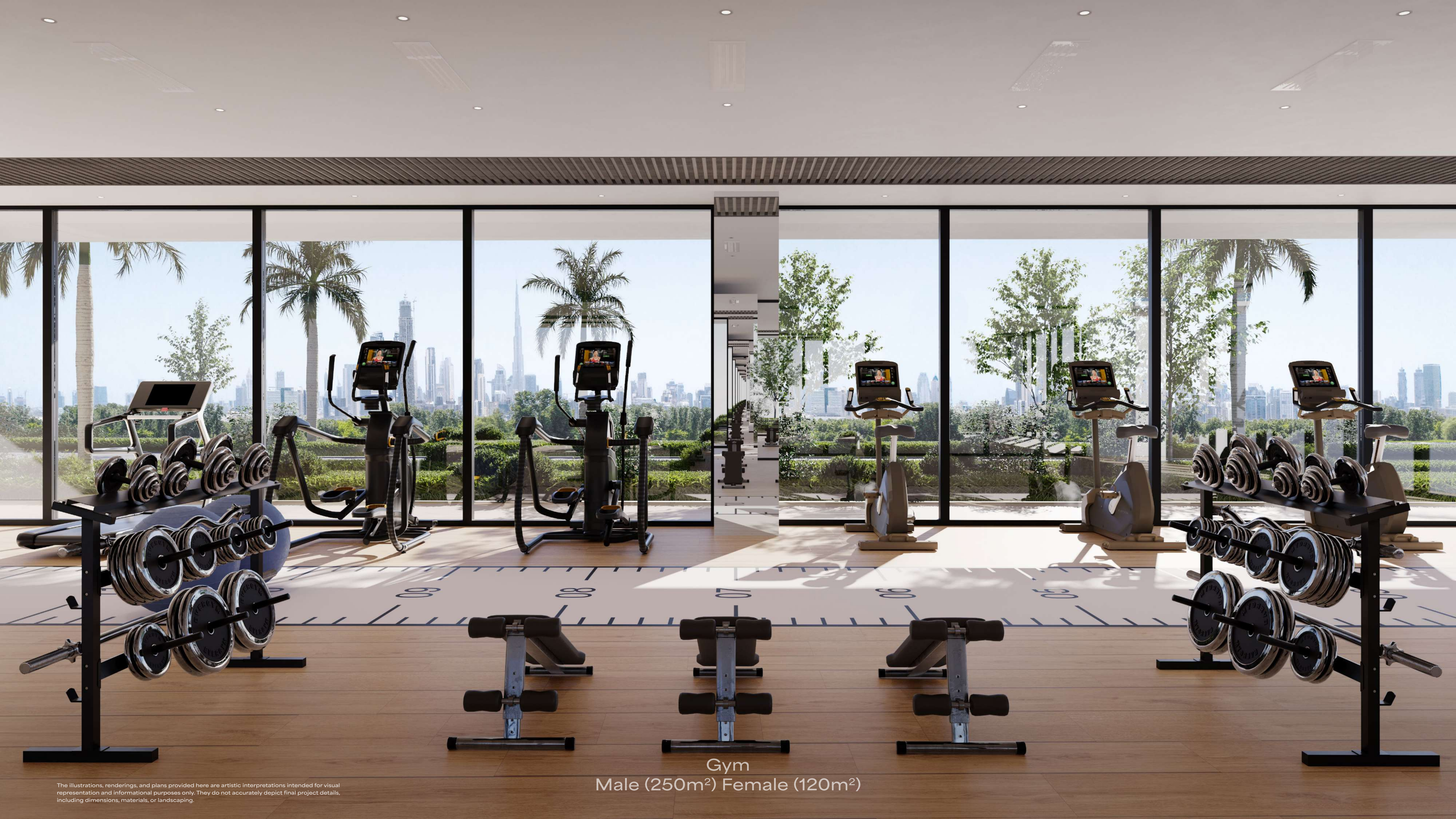
Gym Male (250m 2 ) Female (120m 2 )